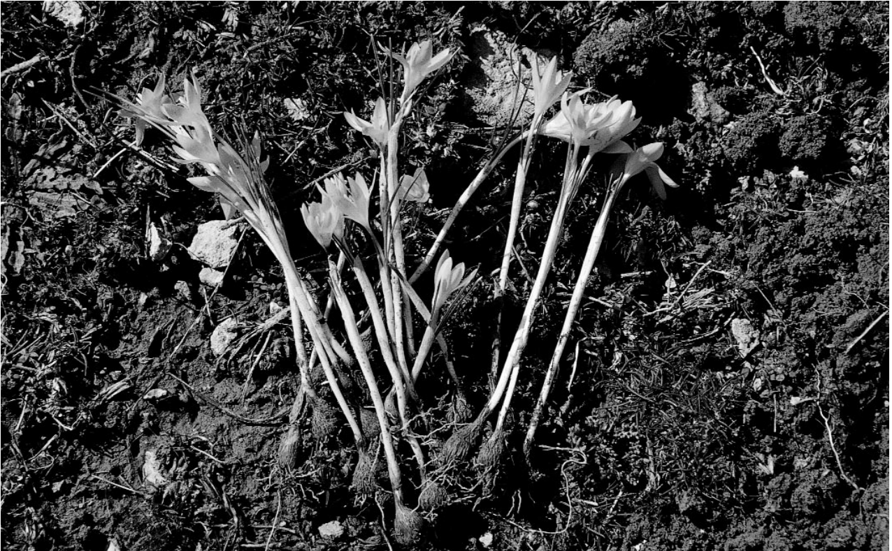
Figure 7 Çiğdem ( Crocus ancycensis ) bulbs are well known edibles of Cappadocia.

In modern Turkish villages, six different edible mushrooms have been recorded. We do not know which of these were consumed by the villagers of Misti. Kostakis said that the common names given to mushrooms were Turkish ( mantarı ) and that the villagers could identify the edible ones and would eat them. Only one special mushroom