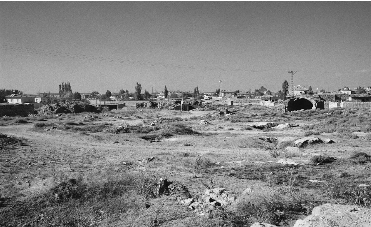
Figure 4 A view from the old section of Konaklı,1998.

Wild plants were also incorporated into social life and into their language, from the children's