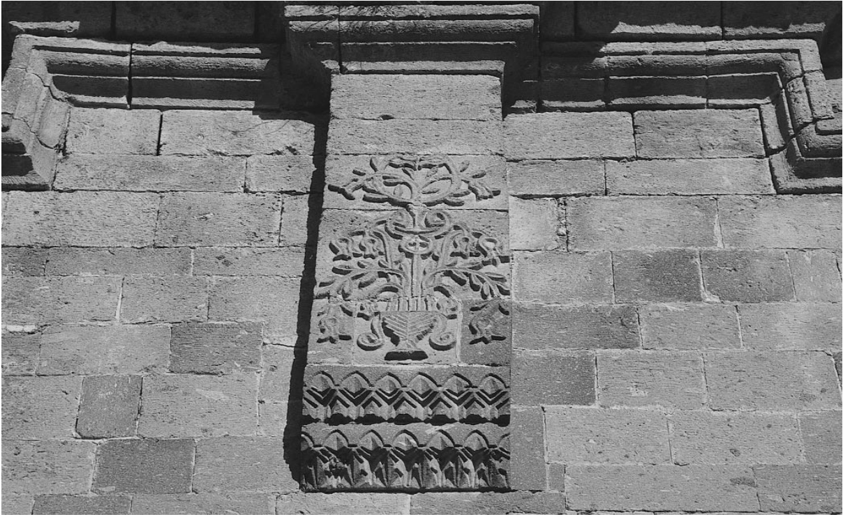
Figure 3 A floral design from the front facade of the Church.

and mattresses. As the poor soils of Misti could not feed the entire population, about eighty percent of the men of Misti would leave their villages twice a year, in March and at the end of July. They worked in the villages or towns of southern Turkey and southern Russia, or travelled to the Aegean islands to make felt and mattresses. Other Greek men in Cappadocia would find jobs during the winter in oil mills ( Bezirhane : Ertuğ 2000c:181, see also endnote 5). According to Kostakis, the poverty of the village was reflected in the furniture of the houses and the people's clothing. Just a few copper, but mostly clay articles comprised the most essential items, all transported from nearby centres and villages. Large