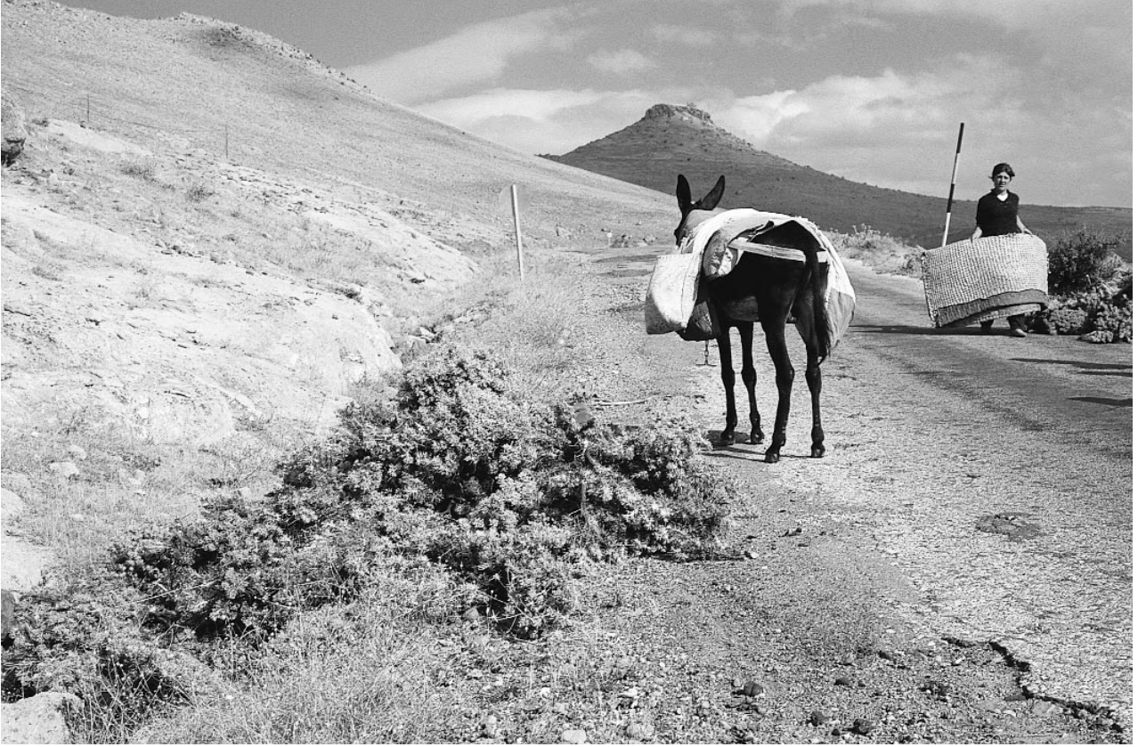
Figure 5 Collection of Astragalus ( Geven ) for fodder in Gelveri (Güzelyurt), Aksaray in 1999.

games to daily idioms and expressions. For example, Koloka seeds were used in the games of Misti children and the elders would intimidate the children by telling them: “I am going to roast you with Galagatra ” which is a thorny fuel plant ( Keteğen/Salsola ruthenica ) with a high heating capacity 9 . The same plant is also used in an expression: “like Galagatra ” for peoples who are thin and in a poor condition. Another plant also used to intimidate the children was Tsutsur , a Verbascum species, which creates swelling when it touches the skin: mothers used to threaten their mischievous sons that they would put this plant in their pants.