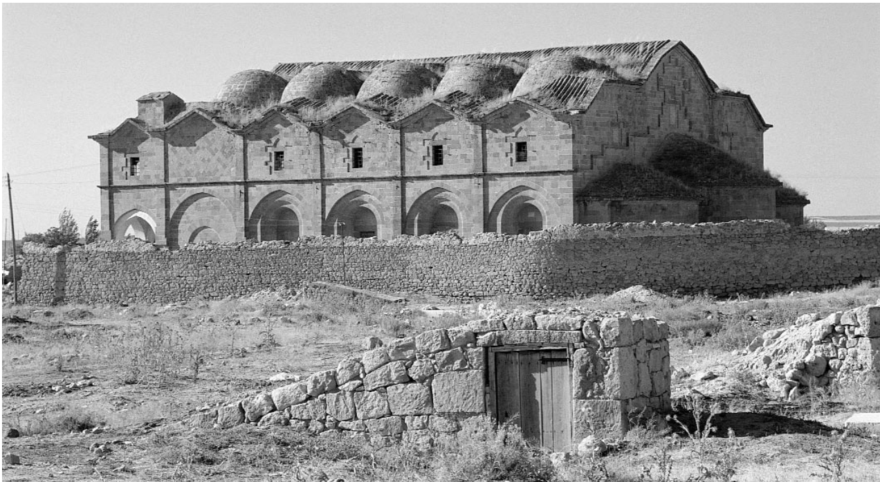
Figure 2 Church of Saint Vlassis in Misti/Konaklı,1998.